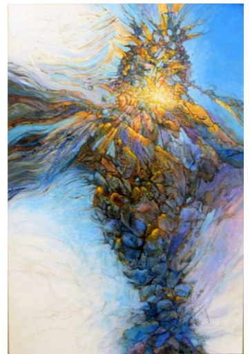
3 rd Place - Water Muse