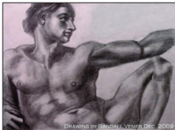
DRAWING BY RANDALL VEMER DEC, 2009

Learn the building blocks for drawing all forms! Use ovals, cubes and cylinders to draw animals and people. We will practice a human head study as well as torso, and pelvis. Randall will introduce the mannequin to draw any action pose. Modified cylinders on top will create a generalized, believable form. We will apply the technique to drawing paintings from the Renaissance and Baroque periods.