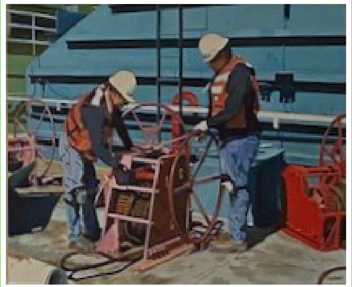
Barge Workers, Christopher Mooney

SWA members were invited to submit 25 pieces of artwork for this project. In response, SWA members submitted traditional, abstract, oil, acrylic, pastel, watercolor, mixed media and photography and with several members lending a hand the works were placed within a few hours. Per the arrangement the consignment period will be for a minimum of six months. Artwork submitted captures, and highlights the people, places and landscapes of Southwest Washington north of the Columbia River (essentially the Third Congressional District) To view the artwork please visit the Offices at 1053 Officers Row, Vancouver WA 98661, Monday – Friday 9-3.