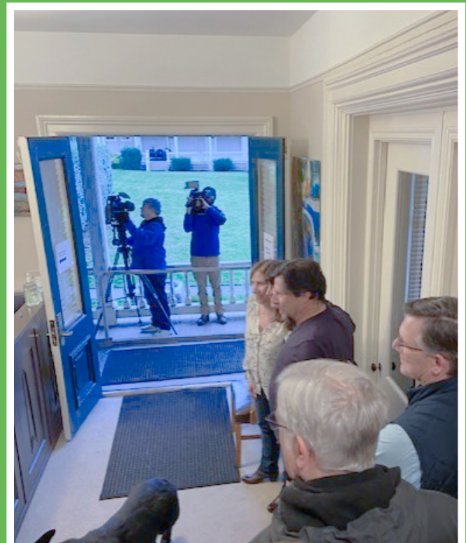
Photo from the Open House