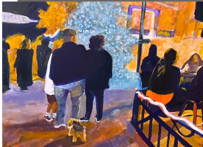
Little Italy, Lila Martin Best in Show, Spring 2021