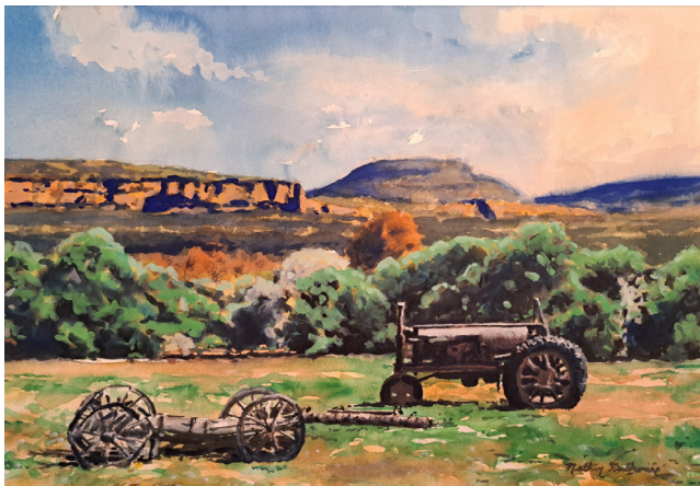
Honorable Mention Nathan Finkhouse, Somewhere in the Southwest