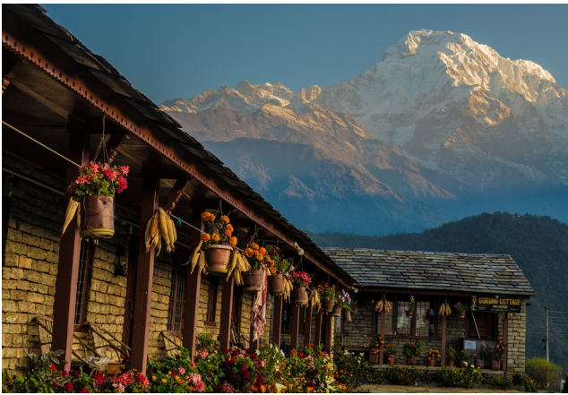
Honorable Mention Leslie Struxness, Glowing FallDay in the Himalayas