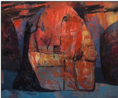
Fly By , Don Gray

Don's list of accomplishments is extensive: shows, books, museum acquisitions, articles and murals all over the country (see one example on page 5 below). His works are both realist and abstract.