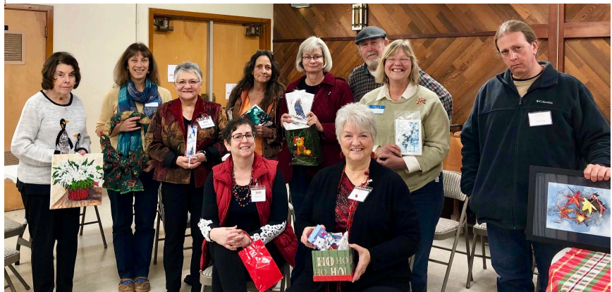
The December holiday get-together included a winter crafts white elephant swap game. Photo by Kathryn Delany (thanks!)