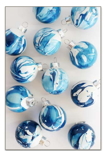
Learn how to make these at http://www.aliceandlois.com/diy-indigo-marbled-ornaments/

Last year, we started a wonderful tradition of gathering our small offerings to make a large difference for a worthy cause. This year we chose the Learning Avenues Preschool located at