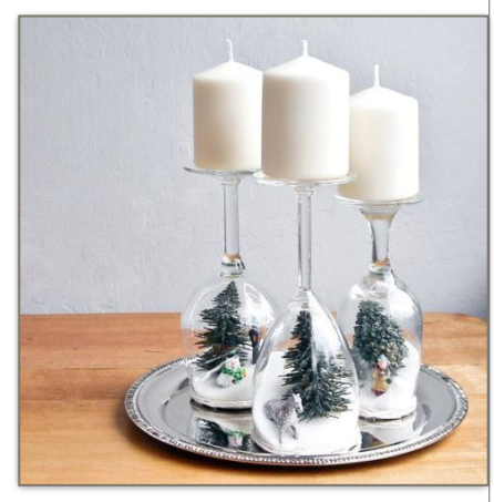
https://www.popsugar.com/smart-living/ Wine-Glass-Holiday-Dioramas-32784178/? crlt.pid=camp.8IsWDava5tom