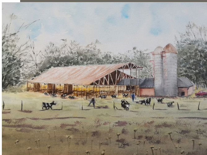
Summer Pastoral, Tao Zhou 1st Place Watermedia Spring 2021