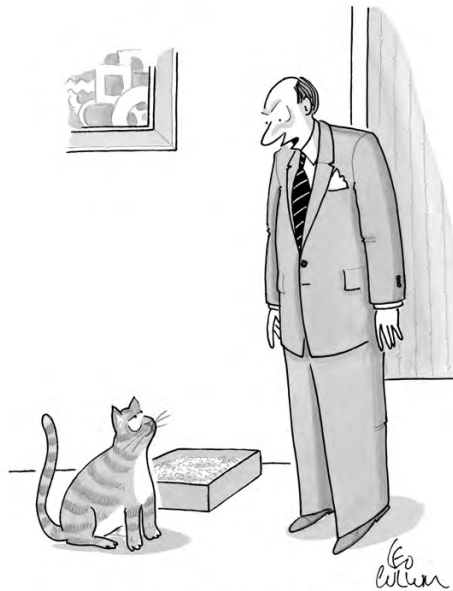
"Never, ever, think outside the box."

November is one of those transitional months. In my book November is there to provide a rest stop before plunging into December and the new year. This year it's a road block as 2020 can't end soon enough. However 2020 has also seen some positive things and one has been this year's SWA Fall Show which is a new type of show, part virtual and part gallery. The virtual portion is a success with 772 unique (new site visitors since October 15th) and continues online at swavancouver.com . The majority of the new visitors were a result of our media staff and members sharing the event with friends and family and through Facebook and other social media sites. In addition to the west coast we expanded SWA's reach to the east coast and as far away as Europe and Australia. I don't think we could have had this type of exposure without having to step outside our usual area of comfort and trying something different. This year SWA met the challenge of holding a virtual art show in October followed with a gallery showing of 100 selected works hosted by Art at the Cave Gallery from November 14th to December 15th. This was a new concept to many of us and definitely out of our comfort zone, but it has opened new doors for SWA in how we present our shows in the future. Check out the page 3 story listing the winners from this years show.